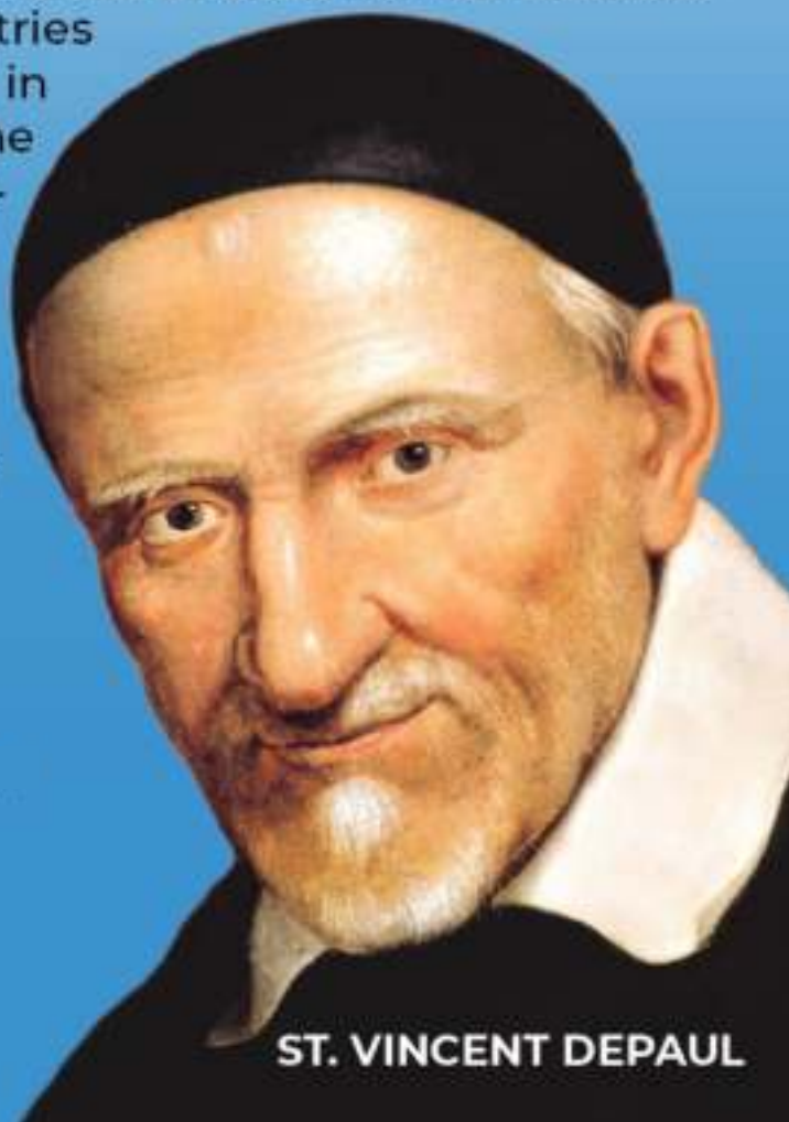
ST. VINCENT DEPAUL

Vocational Director DePaul Centre P.O. Box 24749-00502 Karen, Nairobi