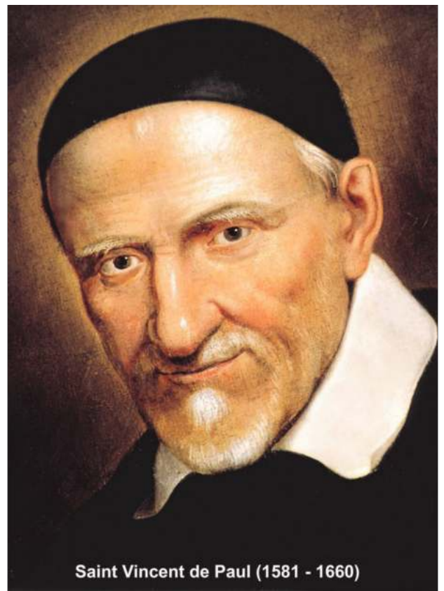
Saint Vincent de Paul (1581 - 1660)

+254 710 771104 | vocations@cmafrica.org