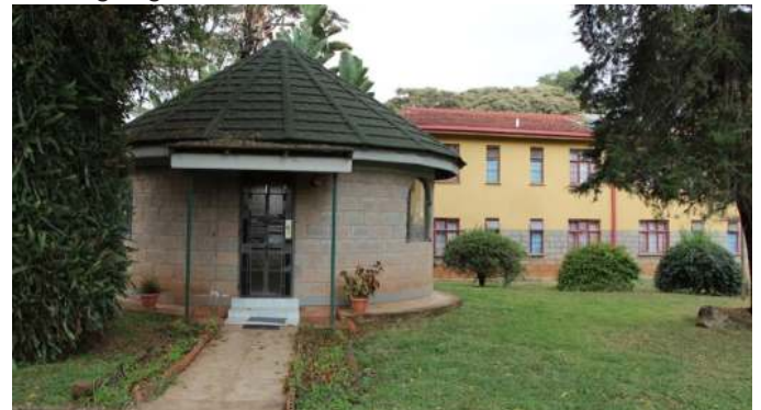
Mwangaza Retreat Centre-Jesuit

In addition to the Mwangaza program, I also resided at the Vincentian residence in Mabanga, Bungoma. There, I offered spiritual accompaniment to seminarians, presided at Masses, engaged in personal study, visited patients, and participated in service to the poor. As a pilgrim in the Jubilee Year of Hope, I also visited Marian shrines in Namugongo, Subukia, and Kibeho.