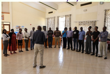
The Safeguarding training for CMs and the lay Staff