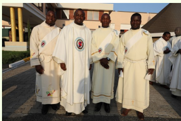
July 2023 Vice provincial Assembly in Nakuru