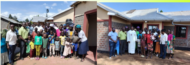
The official opening and handing over of the 13 houses project in Matisi Parish