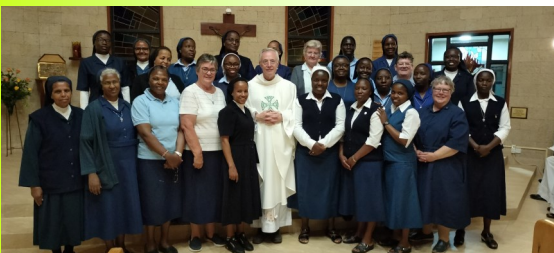
The Superior General Visit to the Vice Province of Kenya